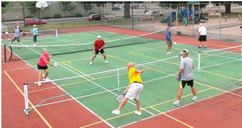
4 pickleball courts on 1 tennis court