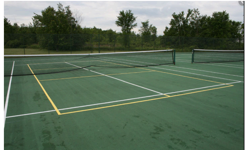
2 pickleball courts on 1 tennis court